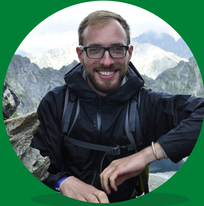
Alexander Agafonov Photographer